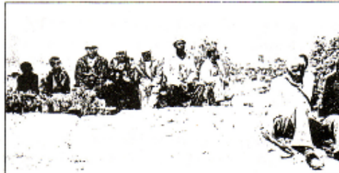
Some members of the 40 families on a farm in Muden town who are uncertain future.

Both communities have warned that tensions are rising, and their fear people might take the law into their own hands.